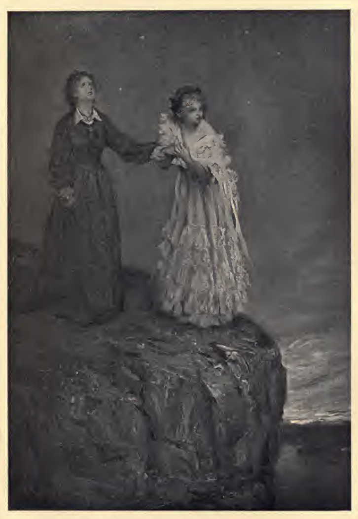
"On the brink of the precipice the mother trembled."